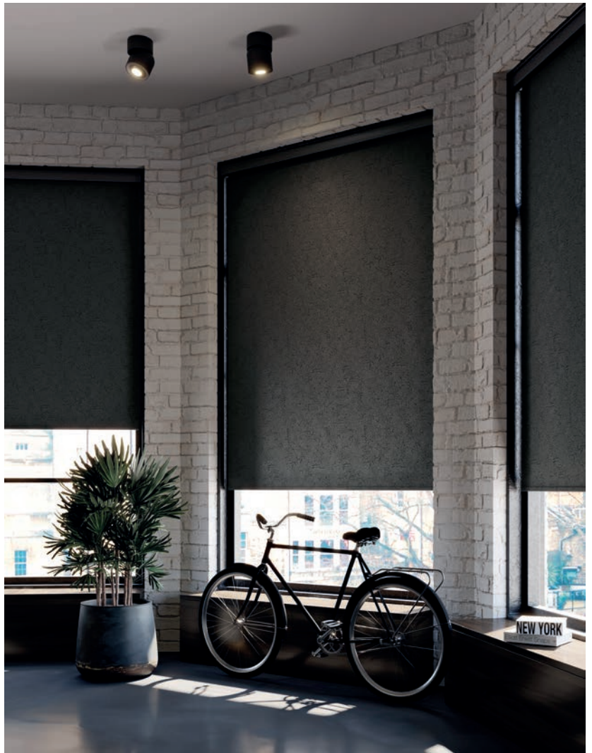
| 19. | METZ BLACK |