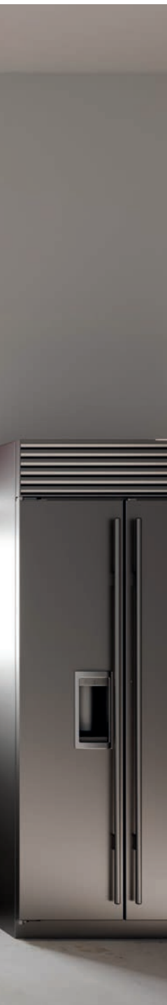
4. | ARONA SIREN