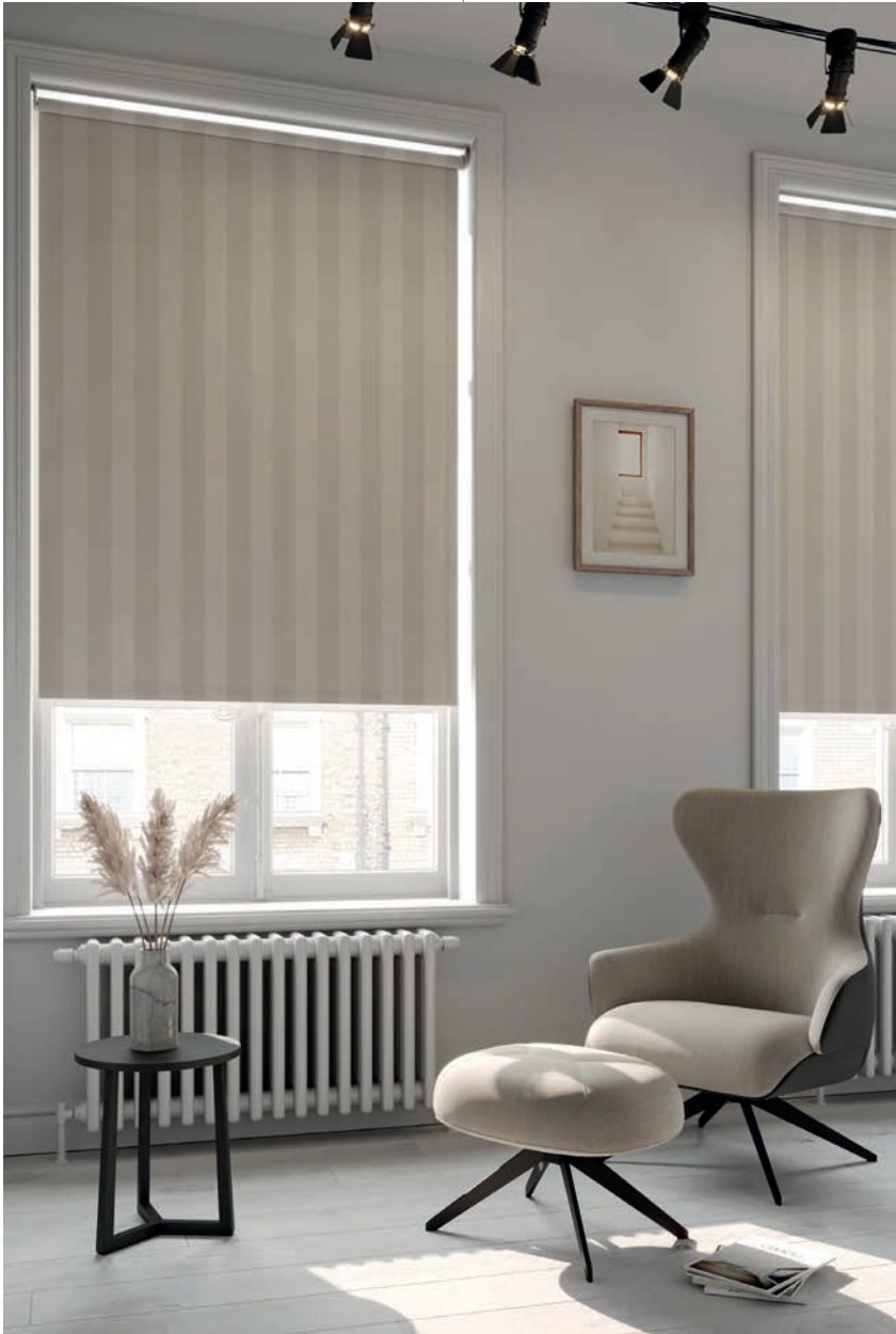
13. | NAPA MERSIN |